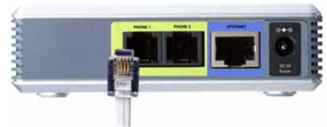
Figure 3-2: Connect the RJ-11 Telephone Cable

IMPORTANT: Do not connect either of the Phone ports to a telephone wall jack. Make sure you only connect a telephone or fax machine to either of the Phone ports. Otherwise, the Phone Adapter or the telephone wiring in your home or office may be damaged.